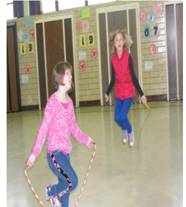
East students enjoy jumping rope to get fit during Jump Rope for Heart week.

stop heart problems. People with heart problems can suffer and die. Students try to get people to make pledges, or promises, to give money to support healthy heart programs. Some students have asked for pledges like one penny for every jump. So stay healthy, get active, and get fit to keep your own heart in good shape. Also support Jump Rope for Heart by donating money to student jumpers.